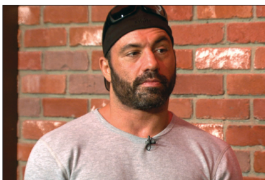
Joe Rogan Comedian Joe Rogan has learned a lot about himself through his many different jobs and interests.

Who has taken significant time to get to know you at school or in other places in your life? Has that relationship changed you at all?