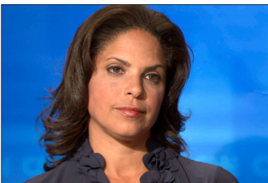
Soledad O'Brien CNN Anchor/Special Correspondent Soledad was determined to succeed despite what anyone told her she could or couldn't do.

Think about your strengths and weaknesses. What may you have to work on to get to where you want to be? Do you have ideas on how you can overcome the challenge?