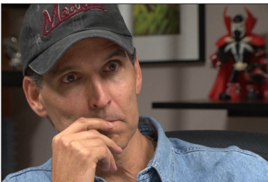
Todd McFarlane Comic Book Artist/Entrepreneur Todd began his career as a comic book illustrator and has become a successful entrepreneur.

Who is your hero—someone you would do just about anything to meet? Why do you want to meet him or her?