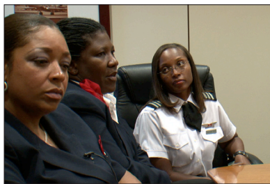
The ASA Flight Crew #5202 These women are the first all female, African-American flight crew.

1) What impact does Flight Crew #5202 believe that they can have on other people who hear their story or see their picture?