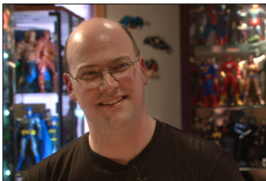
Alex Ross Comic Book Painter/Illustrator Alex has always been passionate about comics.

How do you think that you can create opportunities for good things to happen in your life?