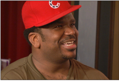
Craig Robinson Actor/Comedian

Craig Robinson jokes around with the Roadtrippers but has plenty of good advice.