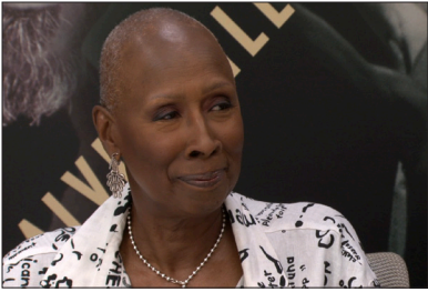
Judith Jamison Artistic Director, Alvin Ailey American Dance Theater Judith has been dancing since she was 8 years old.

3) Who does Judith call ‘spontaneous survivors,’ and what does that phrase mean?