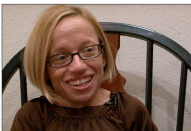
Dr. Jennifer Arnold Neonatologist, Texas Children’s Hospital Jennifer overcame a lot of obstacles to become a doctor.

Do you feel pressured to have everything under control, or figured out, right now? Who makes you feel pressure?