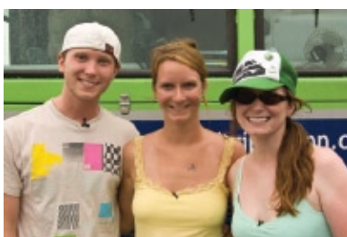
These three Roadtrippers from Montana have been friends for over 10 years, even though they are all very different.

1) What is the unique perspective that each Roadtripper brings to Team Poor, Lazy, Overachievers? Discuss each team member and what individual quality inspired him or her to go on the Roadtrip.