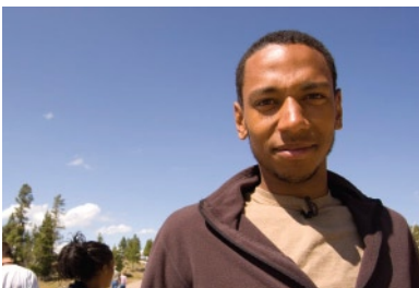
Calvin has made a very conscious effort to make himself seem “normal”.

1) What factors drove Calvin to want to be more “normal?” In what ways did he feel that he already stood out?