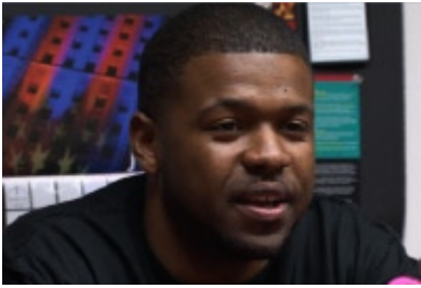
Van struggled for a long time to find success as an artist.

3) Why did Van leave his career as a highly paid broker to become an artist?