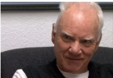
Malcolm McDowell, Actor

Which teacher in your education so far has accepted you for who you are and affirmed you for it? Who has given you the most support in those terms?