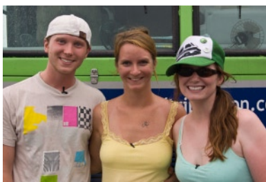
The Roadtrippers have bonded over the course of six weeks on the road.

Do you think that you can find a real “community” on the Internet, one that can support you? Explain which websites might offer you that support.