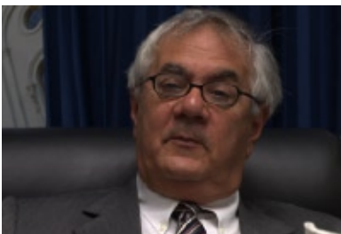
Barney Frank, US Congressman from Massachusetts

From his youth, Barney Frank knew that he wanted to work in politics.